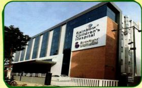
RAINBOW CHILDRENS HOSPITAL RAJAHMUNDRY