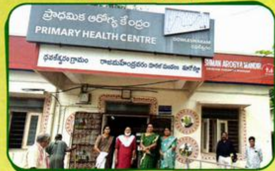
PRIMARY HEALTH CENTRE DOWLAISWARAM