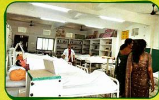
MEDICAL SURGICAL LAB