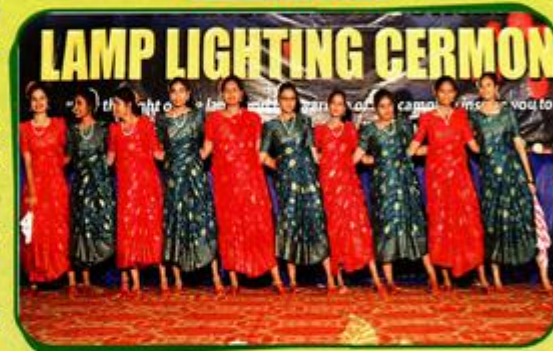
FRESHERS DAY CELEBRATIONS