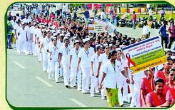
AIDS AWARENESS DAY