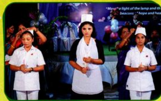
CAPPING & LAMP LIGHTING CEREMONY CELEBRATIONS

In case of any dispute the decision of Satyam Group of Nursing Institutions management will be binding and final. For all legal matters Rajahmundry, Andhra Pradesh is the jurisdicon.