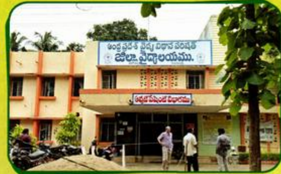
GOVERNMENT GENERAL HOSPITAL RAJAHMUNDRY