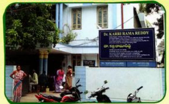
MANASA HOSPITAL RAJAHMUNDRY