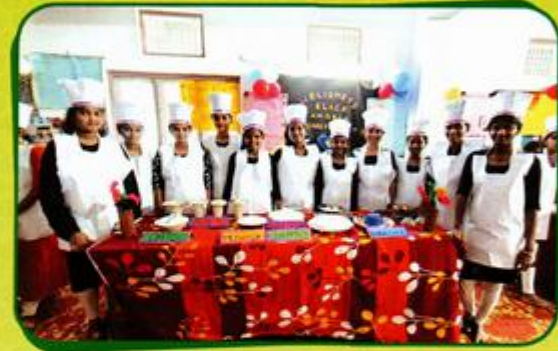
NUTRITIONAL DAY PROGRAMME

We conduct NSS and Blood Donation camps. We conduct different types of programmes on CANCER DAY, AIDS DAY etc. Students celebrate Capping ceremony, Freshers Party, Christmas etc. in the college.