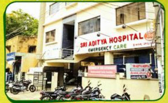
SRI ADITYA HOSPITAL RAJAHMUNDRY