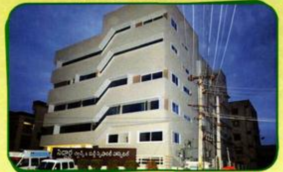
SIDDHARTHA CHILDREN & MULTISPECIALITY HOSPITAL RAJAHMUNDRY