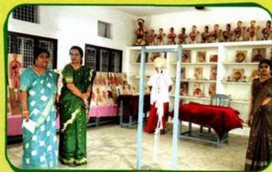
PRE CLINICAL SCIENCE LAB