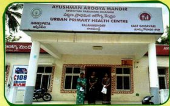
URBAN HEALTH CENTRE INNEPETA, RAJAHMUNDRY