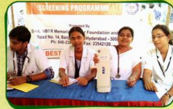
CANCER AWARENESS PROGRAMME