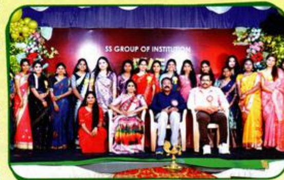
FAREWELL DAY CELEBRATIONS