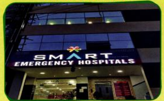
SMART EMERGENCY HOSPITAL RAJAHMUNDRY