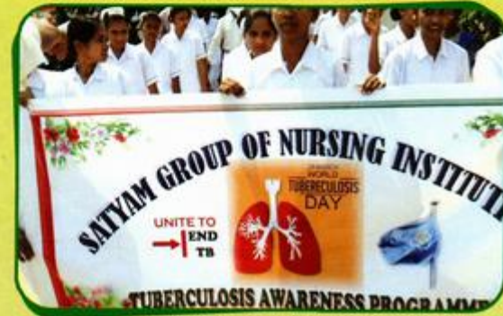
TUBERCULOSIS AWARENESS PROGRAMME