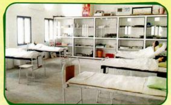
FUNDAMENTAL OF NURSING LAB